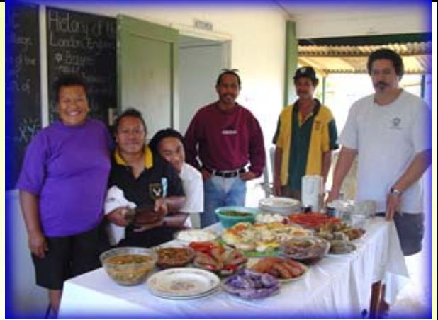
Our Cook Island friends have prepared a fabulous feast for us!