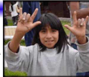
Bolivian deaf girl signs "I love you"

As we moved from day to day experiencing mountains of joy and heart wrenching sadness we realized what an honor it was for us to be on a team delivering the loving gifts from children back home.